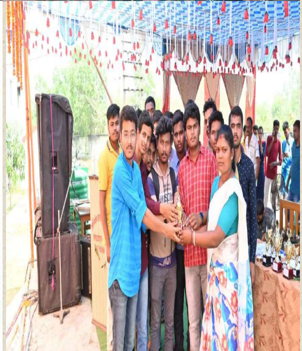
The Department of English stood 2 nd in the Annual Exhibition Competition-2022