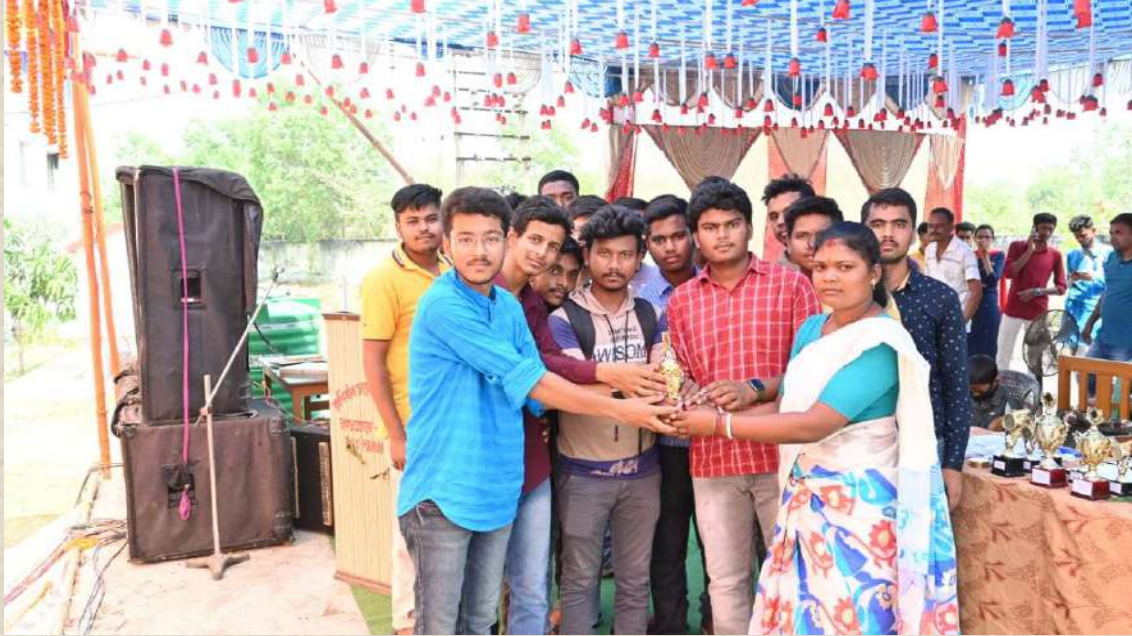
On 31 st March 2022 Department of English receives the 2 nd position award for Cultural Exhibition competition.

Vill + P.O. :Rautara *P.S. : Barikul *Dist. : Bankura *Pin Code: 722135* West Bengal* India